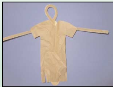
Steps 5 and 6