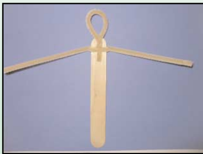
Steps 2, 3, and 4

Be creative! Use another color of twisted chenille for hair and draw or make patches for the robe out of paper or other materials. Make feet.