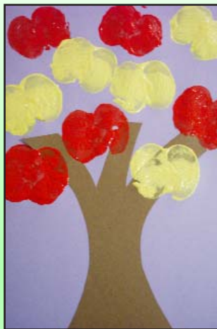
Steps 6 and 7