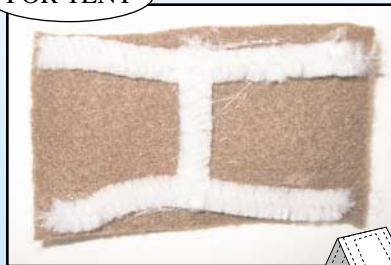
Steps 3 and 4