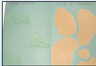
Steps 5 and 6